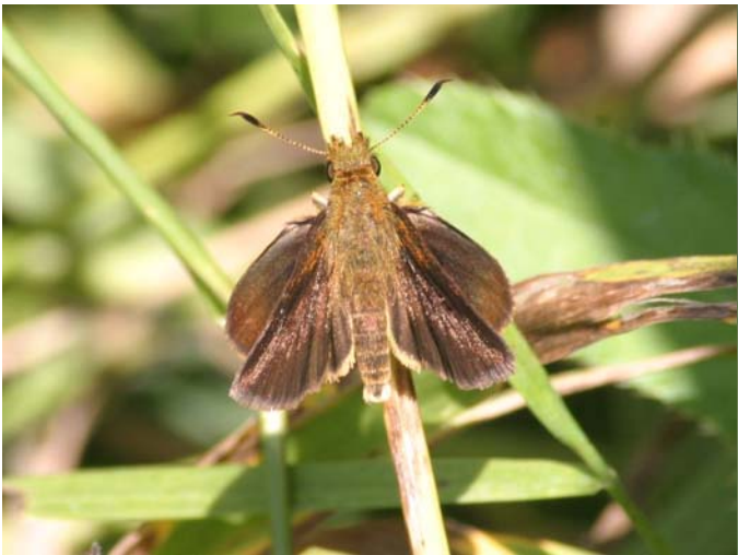
Photo 9. Mulberry Wing.