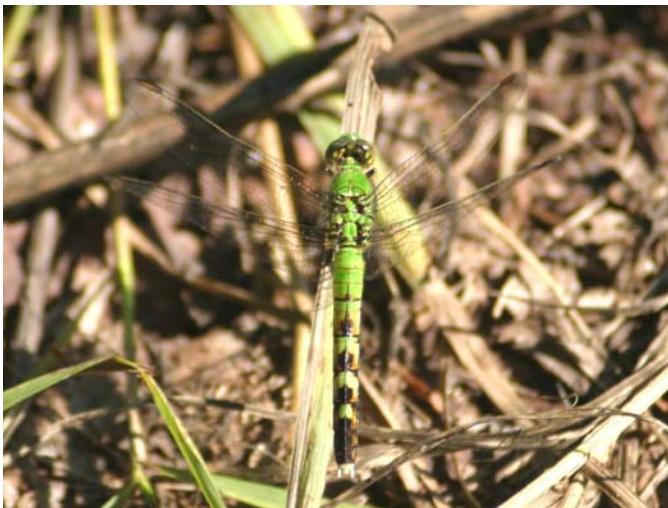
Photo 3. Eastern Pond Hawk, female.

Praying Mantis Several species of grasshopper and katydid Milkweed Beetle White-faced hornet