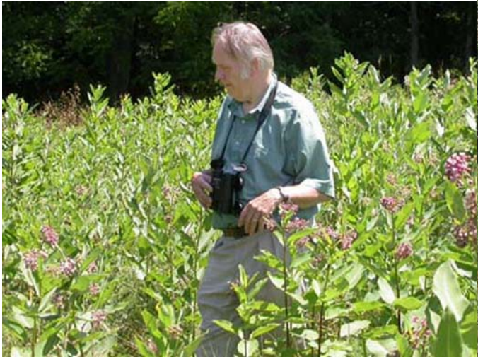
Photo 1. Our intrepid guide.