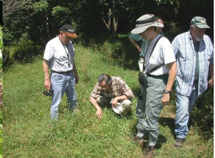
Photo 2. Some of the LON group at Goose Pond Mtn..