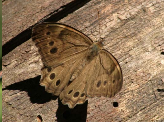
Photo 8. Northern Pearly-Eye.