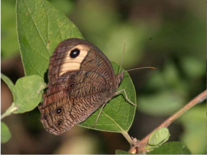
Photo 7. Common Wood Nymph.